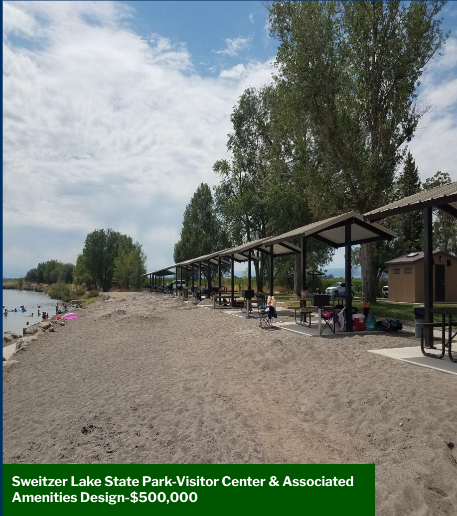
Sweitzer Lake State Park-Visitor Center & Associated Amenities Design-$500,000