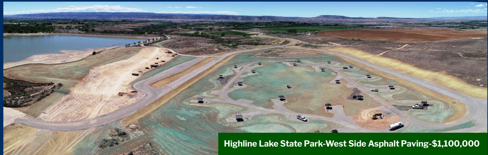
Highline Lake State Park-West Side Asphalt Paving-$1,100,000