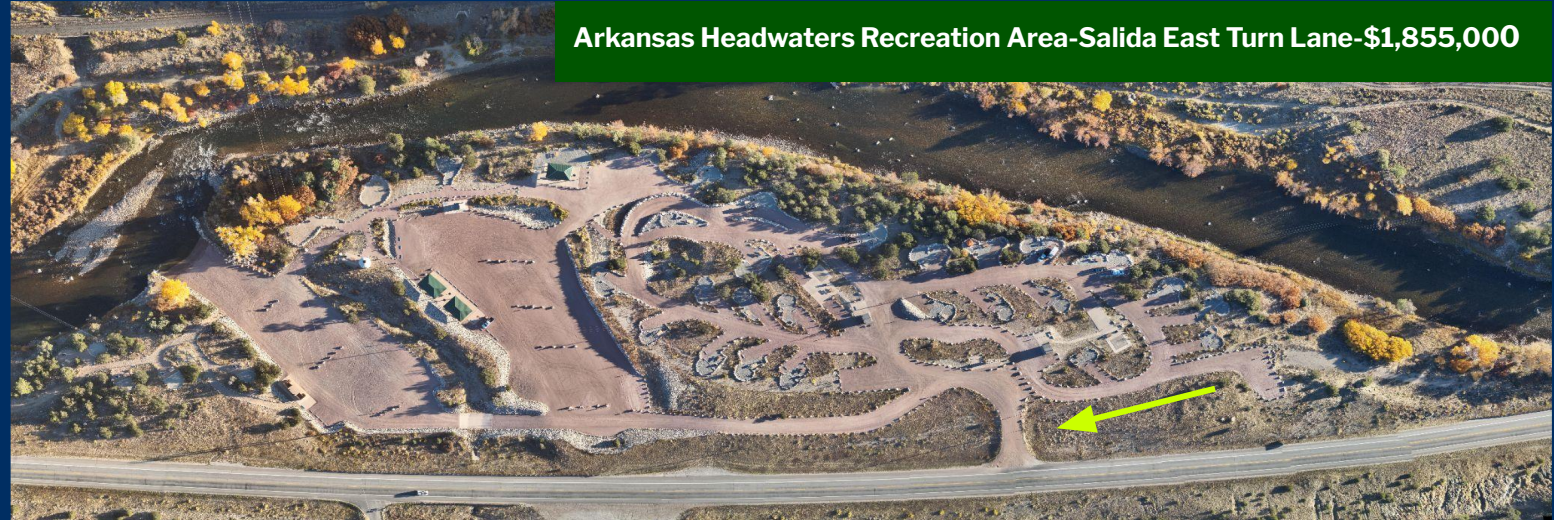
Arkansas Headwaters Recreation Area-Salida East Turn Lane-$1,855,000