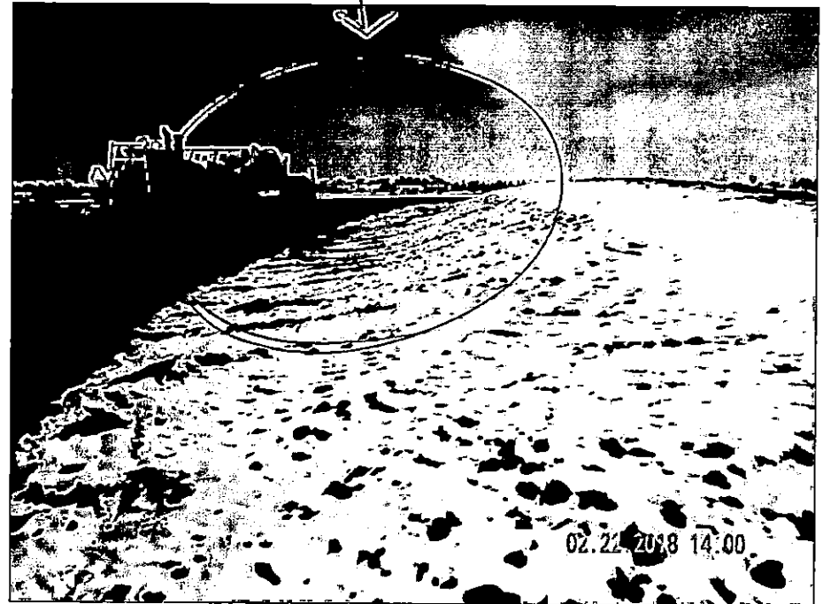
Photo 6. Photo taken from the eastern location, facing North. Appears topsoil has been stored along the eastern perimeter of the location. However, it does not appear the Operator has salvaged topsoil per Rule 1002.b.(1).