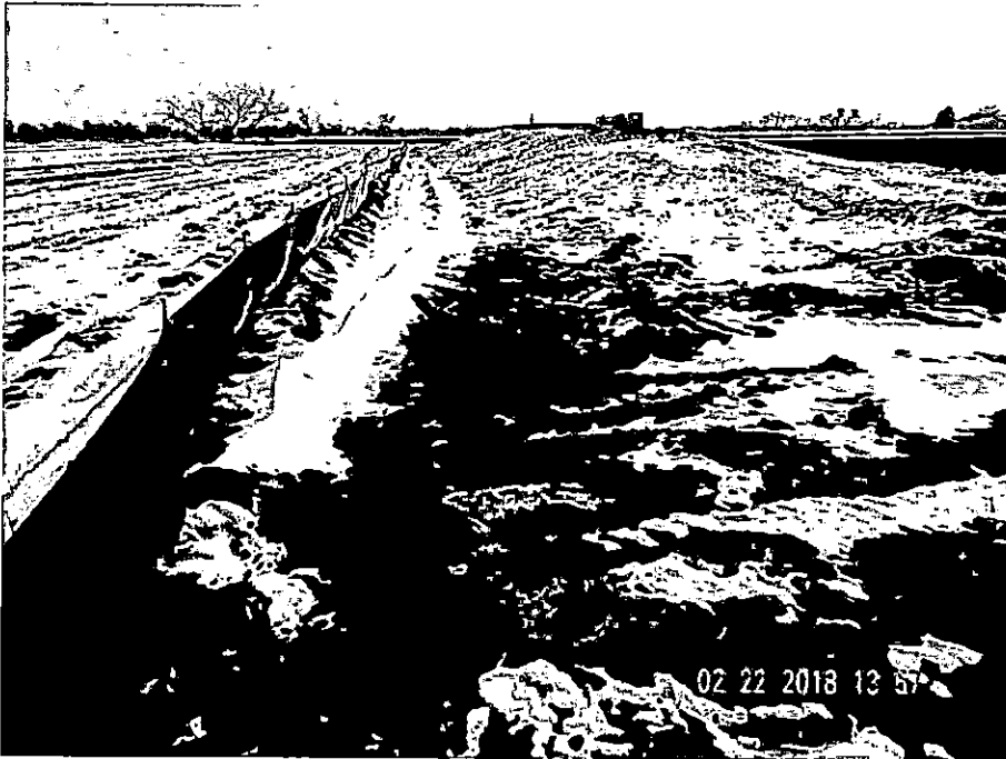
Photo 5. Photo taken from the northeast location, facing South. See comments under Photo 1.