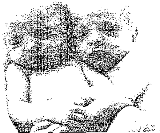
No 'gay' gene is hardwired in the DNA of babies

Numbers of people who have changed towards exclusive heterosexuality are greater than current numbers of bisexuals and homosexuals combined. In other words, ex-“gays” outnumber actual “gays”. The fluidity is even more pronounced among adolescents, as Bearman and Brueckner’s study demonstrated. “They found that