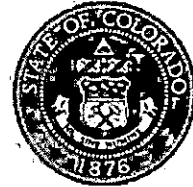
John W. Hickenlooper Governor

136 State Capitol Denver, Colorado 80203 Phone (303) 866-2471 Fax (303) 866-2003