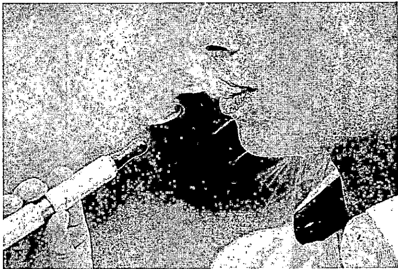
File photo E-cigarette use among middle and high school students tripled from 2013 to 2014 nationwide, according to the Centers for Disease Control.