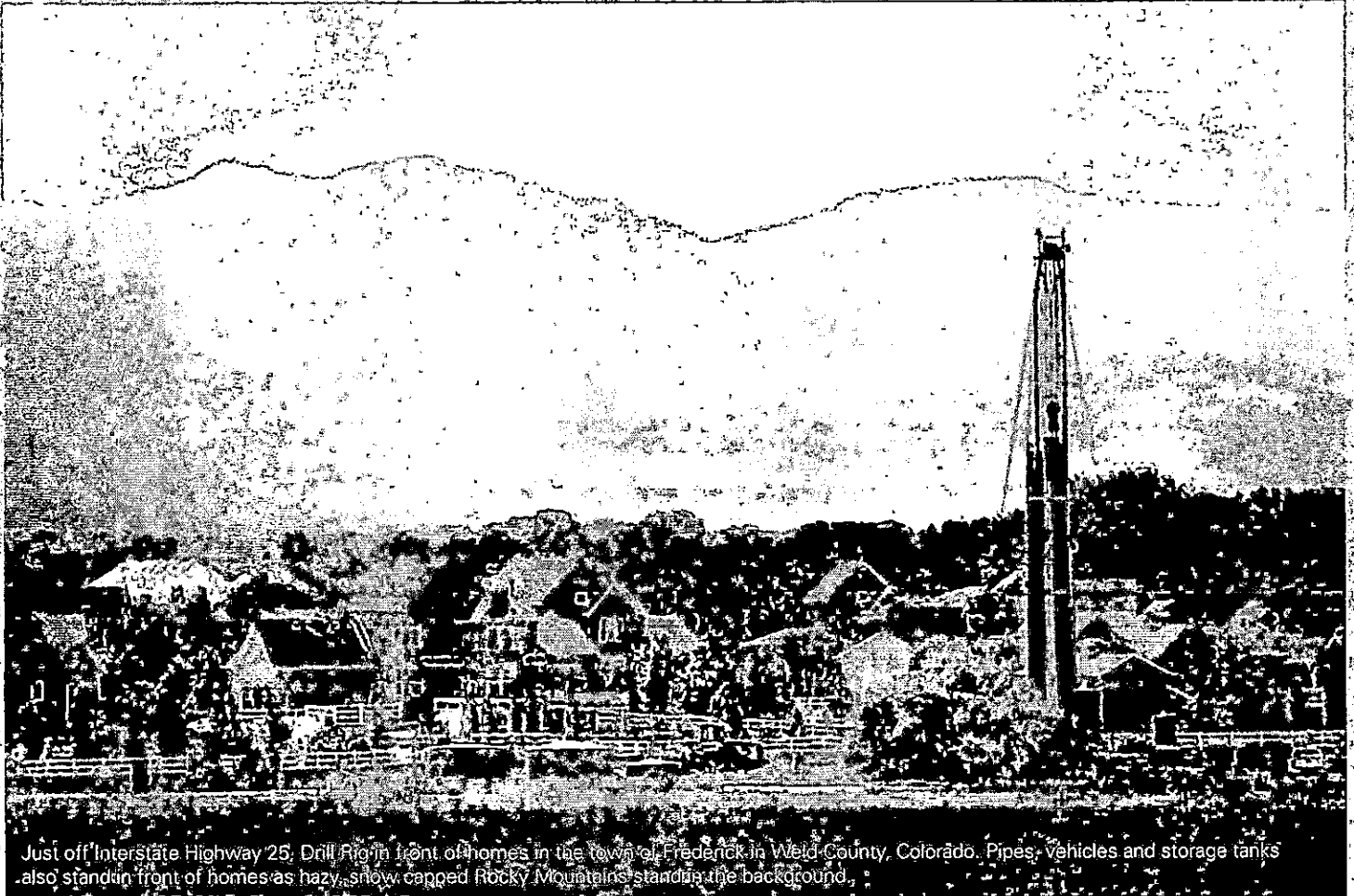
Just off Interstate Highway 25, Drill Rig in front of homes in the town of Frederick in Weld County, Colorado. Pipes, vehicles and storage tanks also stand in front of homes as hazy, snow-capped Rocky Mountains stand in the background.