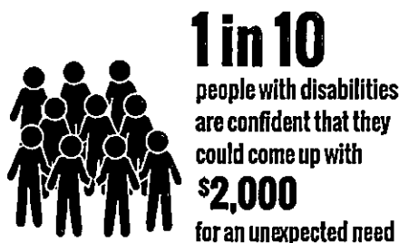
FIGURE 1. Many people already struggle to pay for the basics. Paid leave is a must.