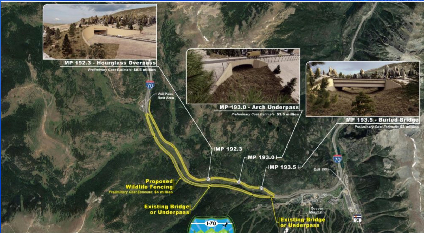
Proposed Wildlife Fencing