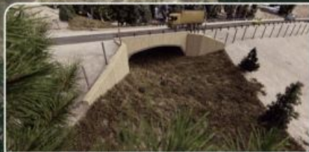
MP 193.0 - Arch Underpass