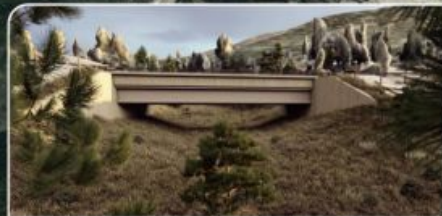
MP 193.5 - Buried Bridge