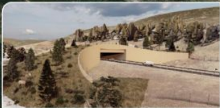
MP 192.3 - Hourglass Overpass