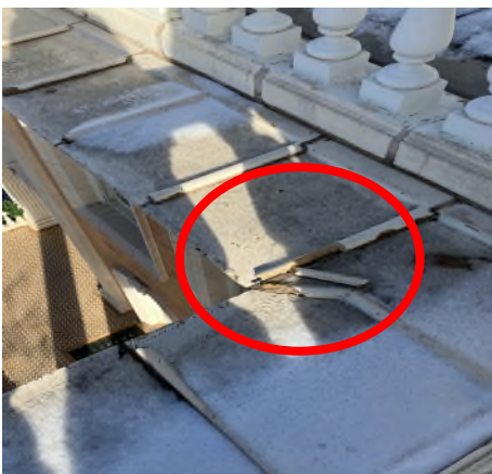
Loose terra cotta has begun to fall from the eaves and roof, and exacerbate moisture issues.