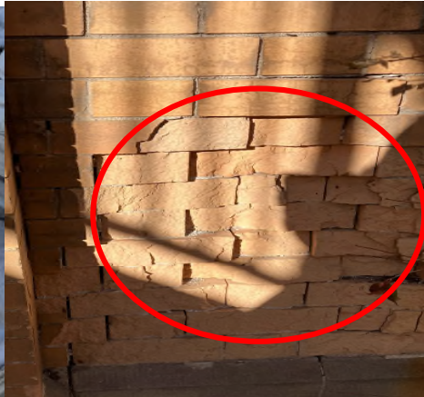
Gutter issues and snow accumulation has contributed to masonry deterioration in key areas.