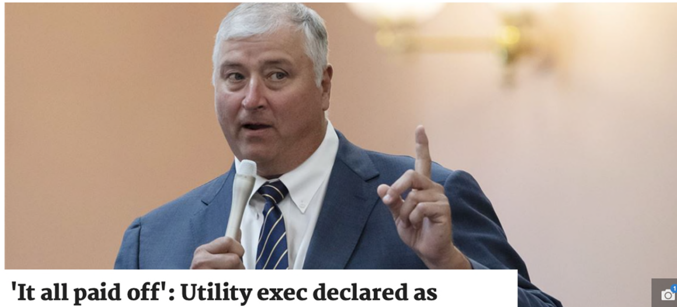
'It all paid off': Utility exec declared as nuclear bailout passed