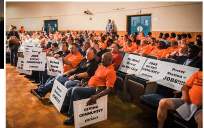
Plant supporters at the October 2017 meeting.