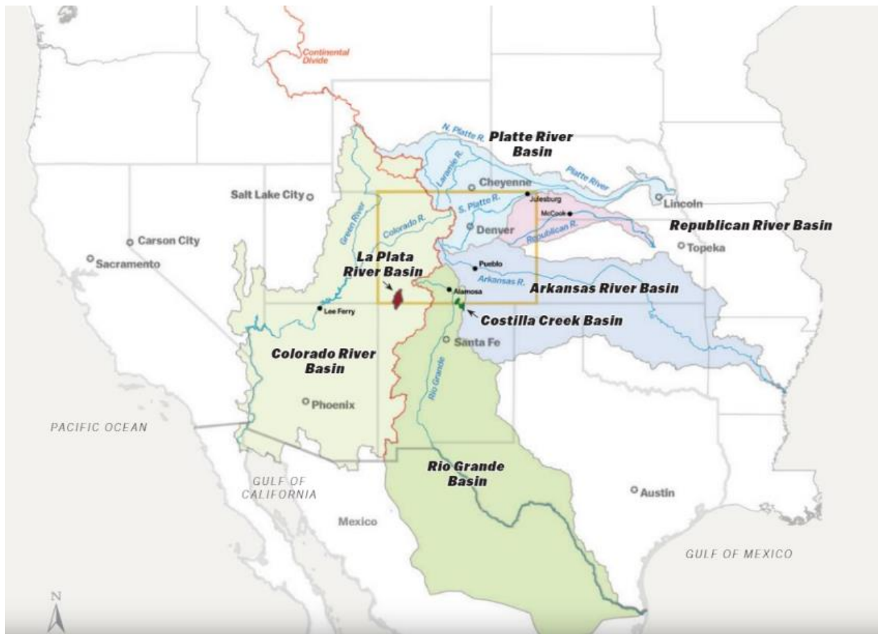
Figure 1 Geography of River Basins Governed By Interstate Compacts

An interstate compact is an agreement between two or more states that has been approved by their state legislatures and Congress. Specifically, a water compact sets the terms for sharing the waters of an interstate water system. Figure 1 shows the seven basins that are governed by interstate compacts involving Colorado.