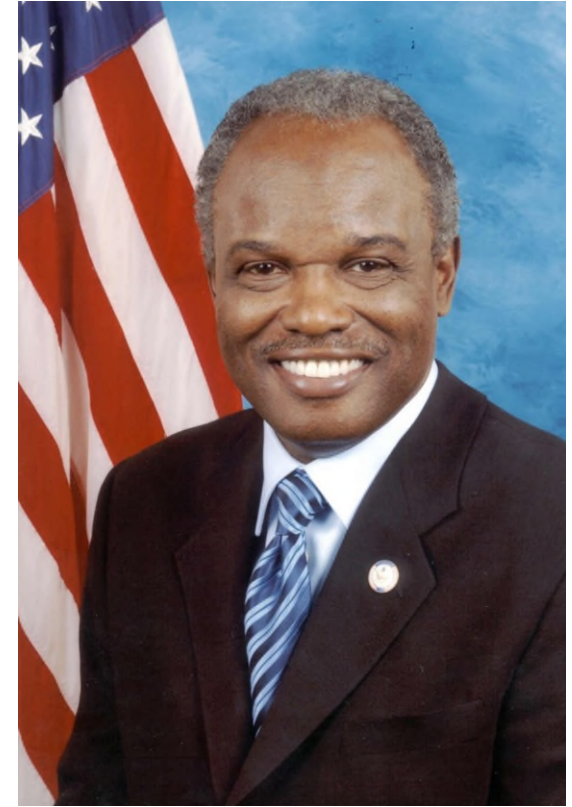
Ranking Member David Scott (D-GA)