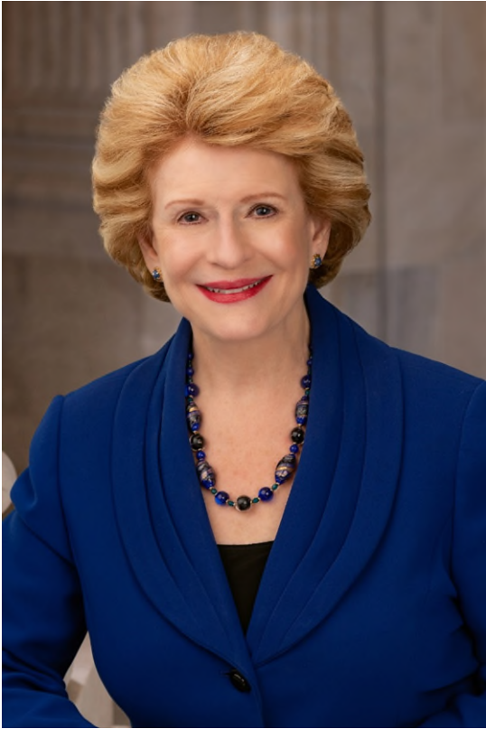
Chairwoman Debbie Stabenow (D-MI)