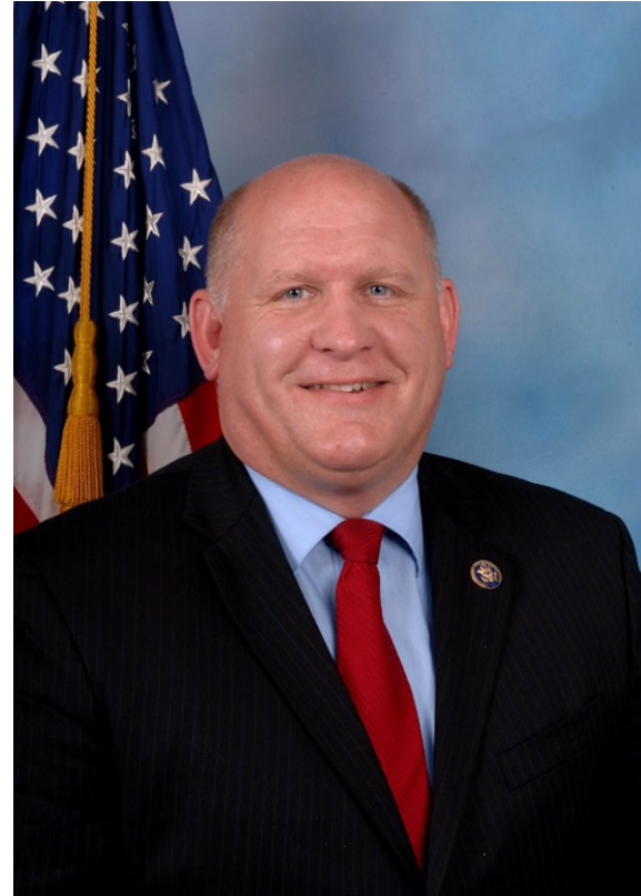
Chairman GT Thompson (R-PA)