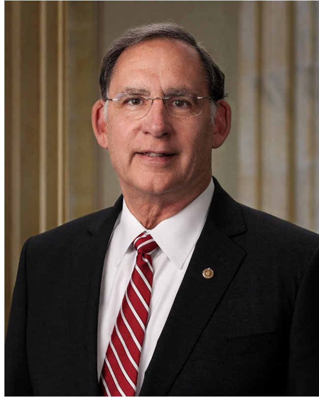
Ranking Member John Boozman (R-AR)