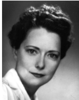
Margaret Mitchell August 16, 1949