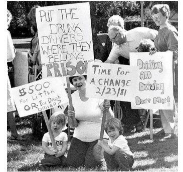
MADD Est.: 1980