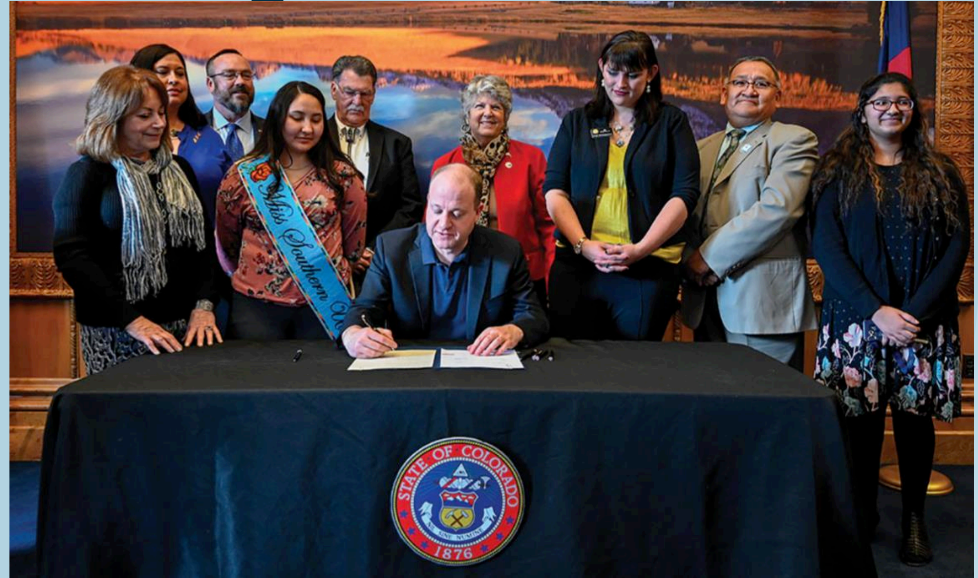
Photo of Governor Polis and members of the Colorado AI/AN community from CCIA