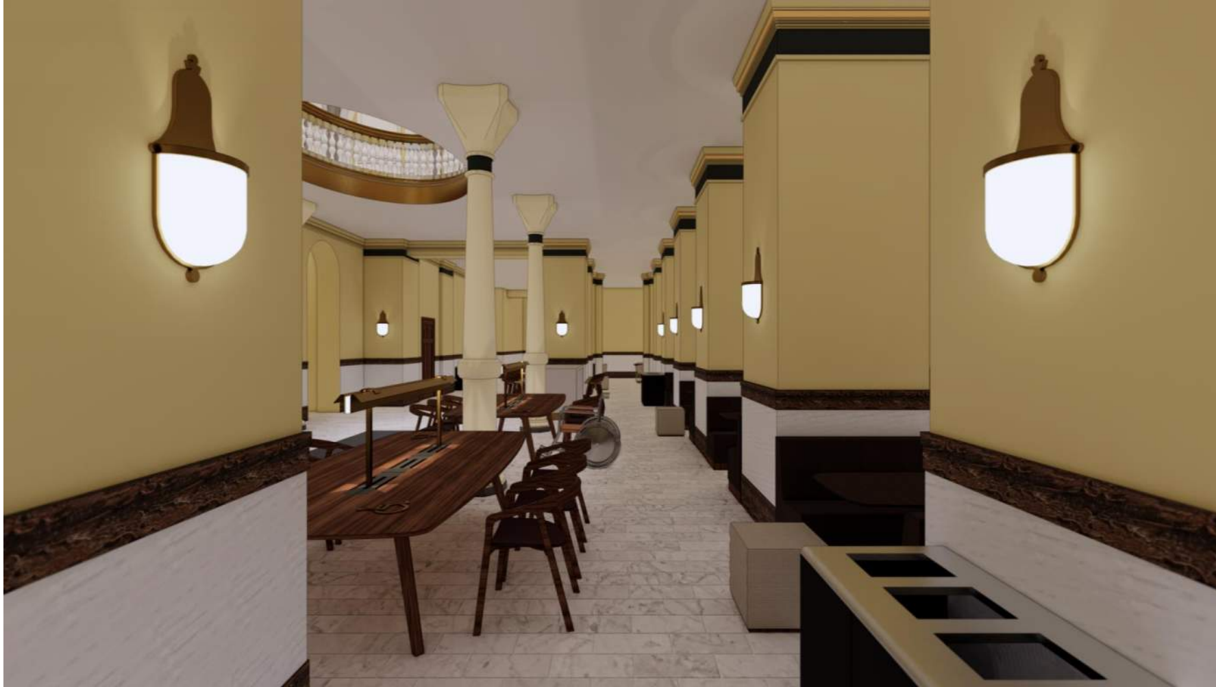
VIEW FROM CAFE LOOKING PLAN WEST - LIBRARY TABLES W/INTEGRATED LIGHTING