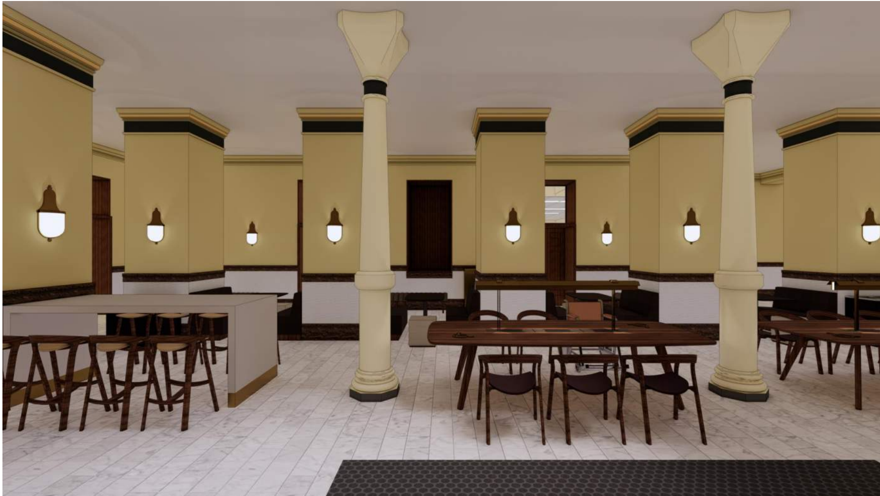
VIEW FROM CAFE LOOKING PLAN NORTH