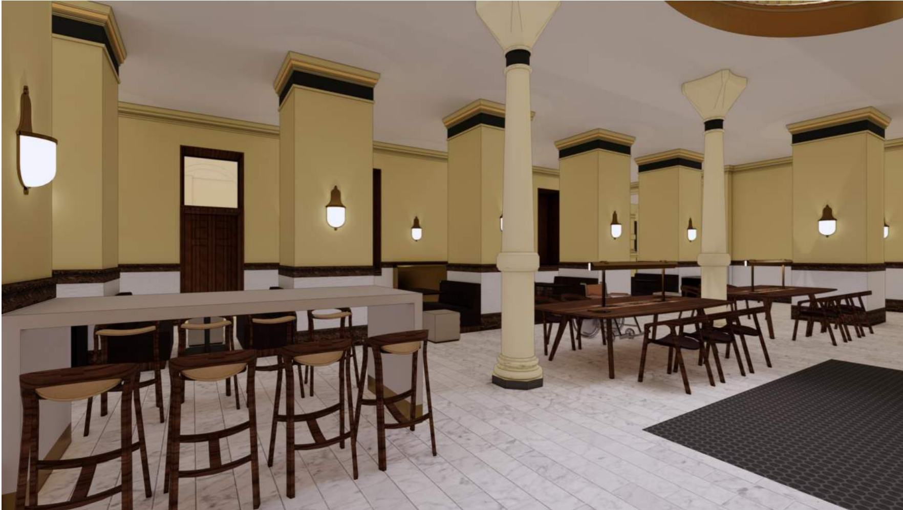
VIEW FROM CAFE LOOKING PLAN NORTH EAST - STANDING HEIGHT COMMUNITY TABLE - LIBRARY TABLES W/INTEGRATED LIGHTING