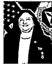
Wing Commander, Civil Air Patrol Col. Celeste Garnache