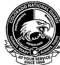
Division of the National Guard