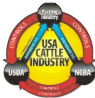
Diagram of the U.S. Cattle Industry