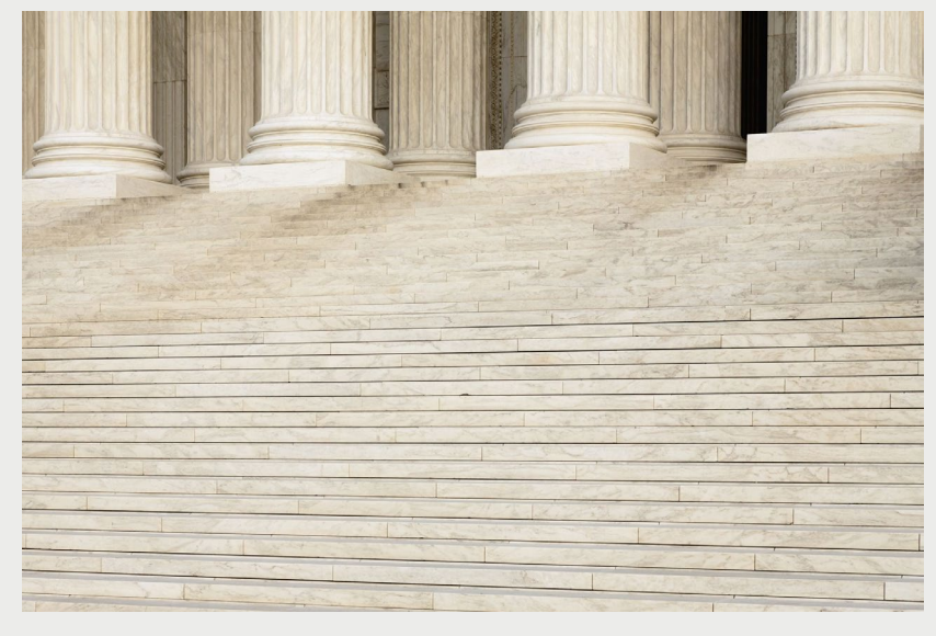
Access & Engagement