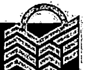
President, Colorado Northwestern Community College