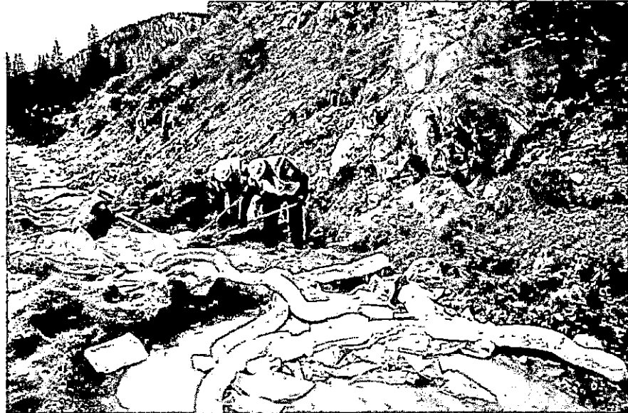
A containment crew attempts to block contaminants from a wrecked tanker truck on Loveland Pass from reaching the North Fork, a relatively pristine Blue River tributary