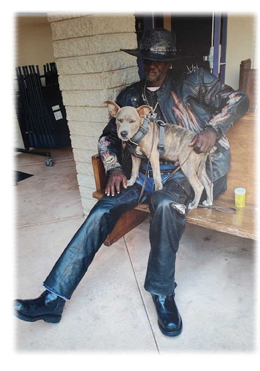
Peticaid Colorado Study Bill