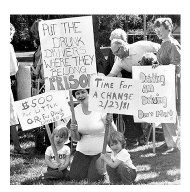
MADD Est.: 1980