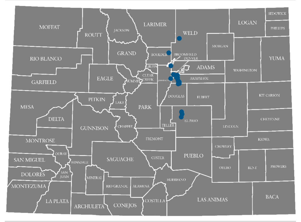
EXHIBIT 1.1. LOCATION OF REGIONAL HOME OFFICES OF INSURERS THAT CLAIMED THE RATE REDUCTION TAX YEAR 2018